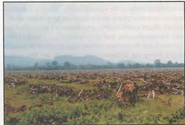
Figure 3. Photograph of Mount Baturong taken facing south.