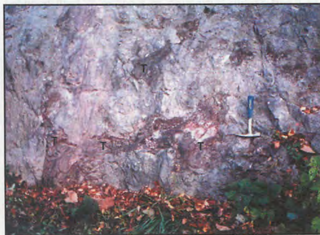
Figure 6. Outcrop of Permian seamount limestone with Triassic cave deposits (T) from Hachiman, Mino terrane, Japan.