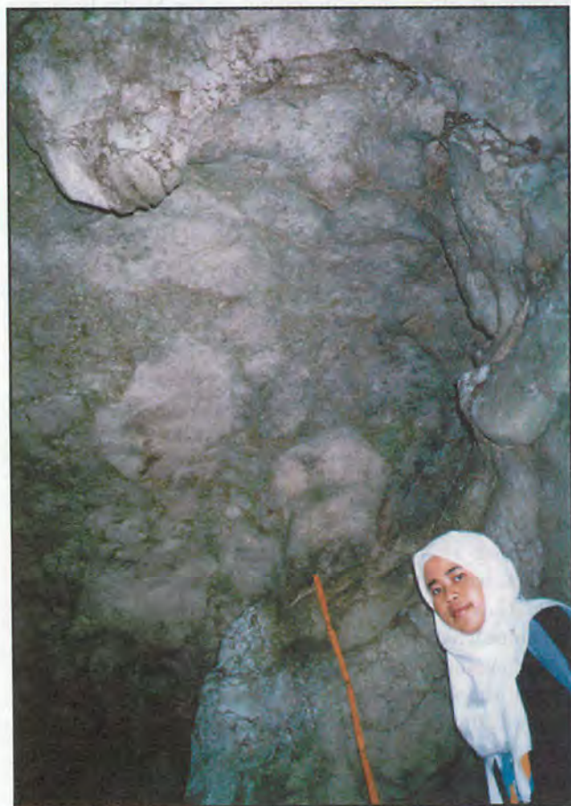
Figure 5. Limestone breccia located 75m southeast of the southern entrance to the Madai Caves.