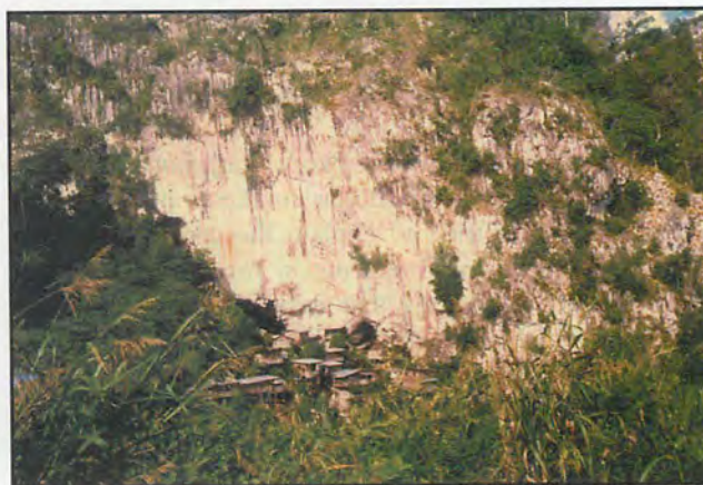
Figure 7. Photograph of northern entrance to Madai Caves taken in 1993 facing southwest.