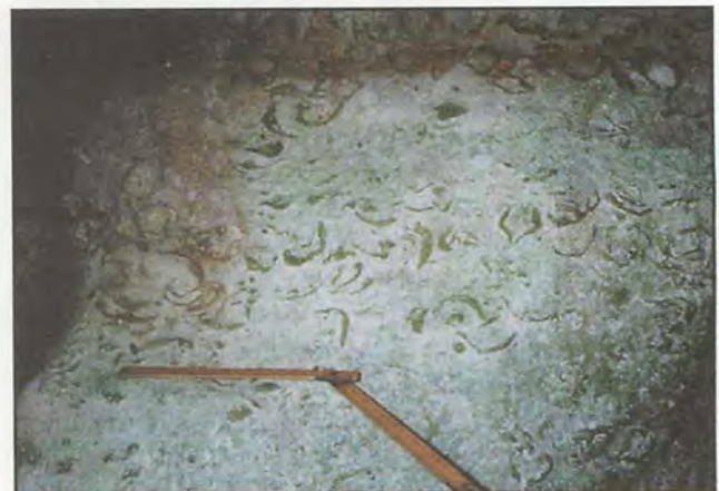
Figure 4. Photograph of bands of thick shelled bivalve fossils in northwestern part of Baturong.